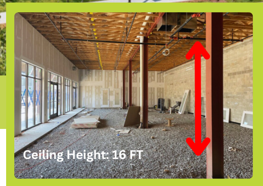
Ceiling Height: 16 FT