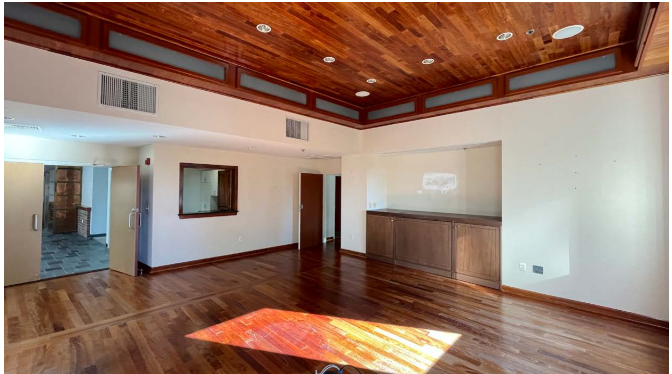
SECOND FLOOR 7,000SF